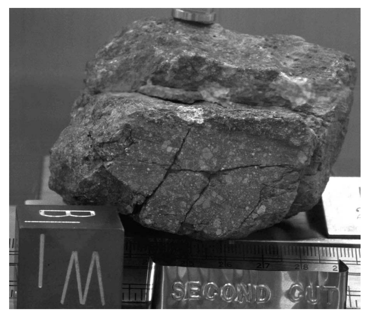
The block is 1", the scale is in cm, S-71-38662