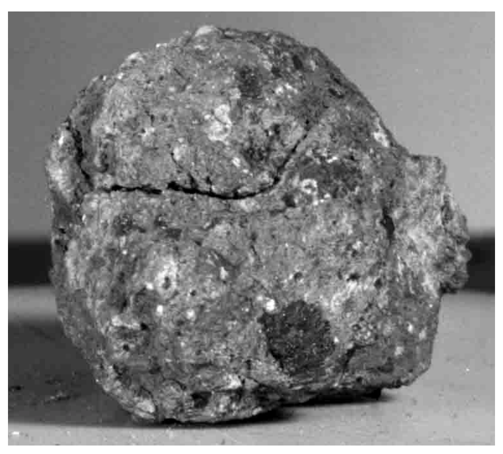
Width of image is approximately 3.5 cm, S-71-26634