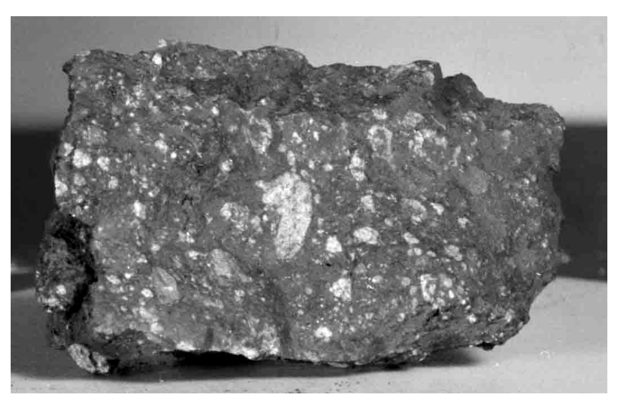
Width of image is approximately 3 cm, S-71-26632