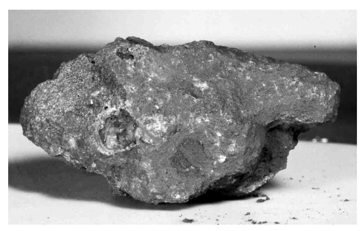
Width of image is approximately 3.5 cm, S-71-26622