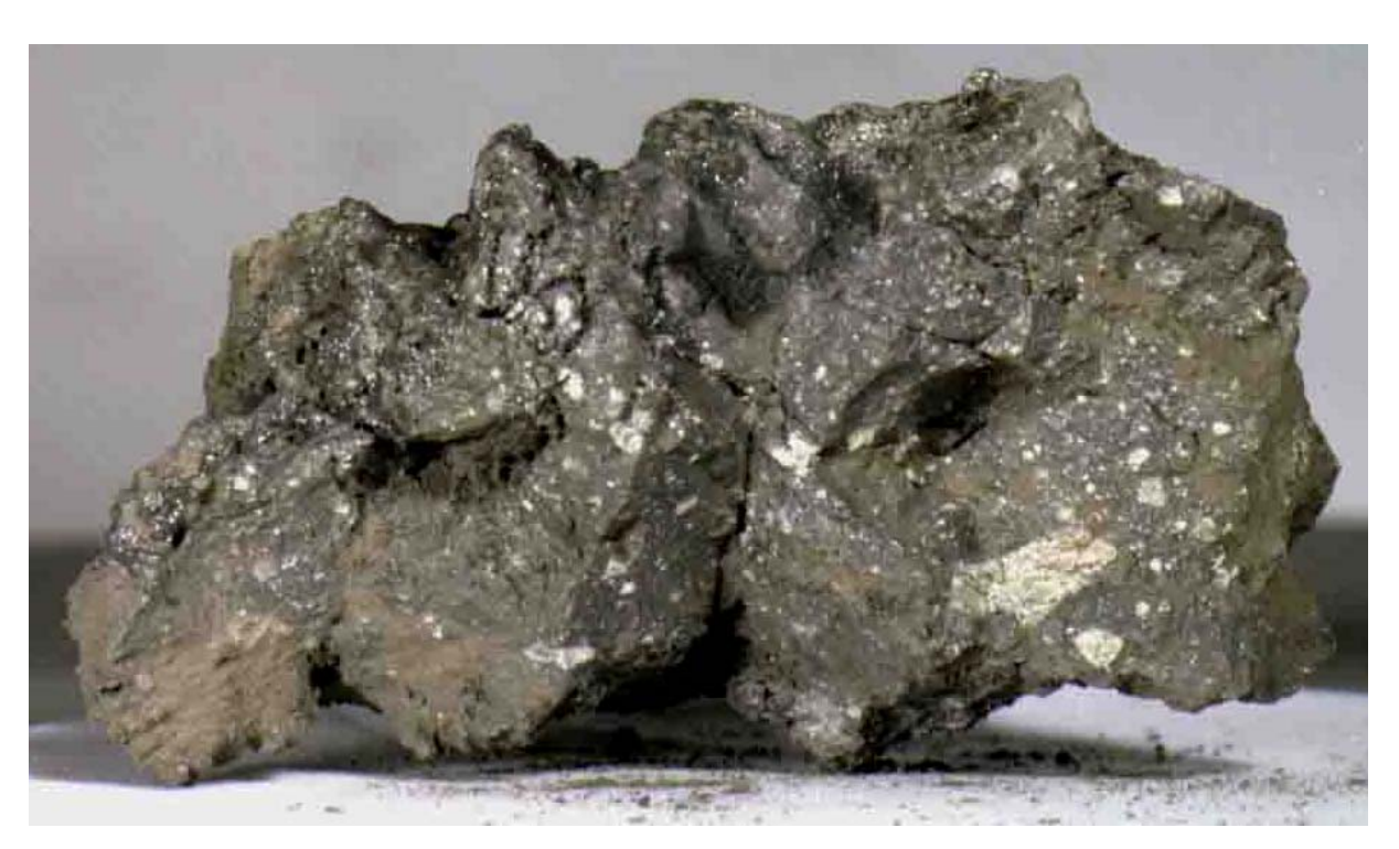
Width of image is approximately 7.5 cm, S-71-29172