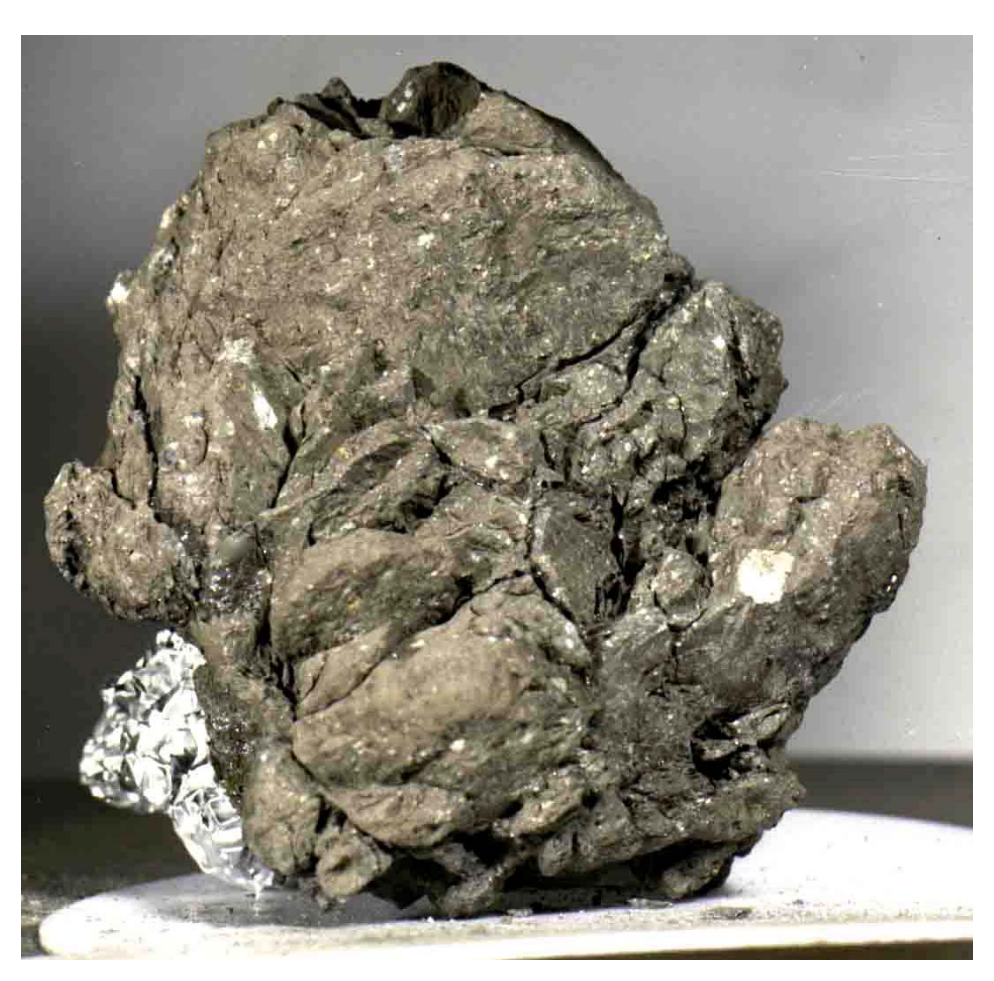
Width of image is approximately 5.5 cm, S-71-29151