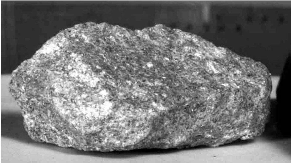
14074: width of image is approximately 3 cm, S-71-26059