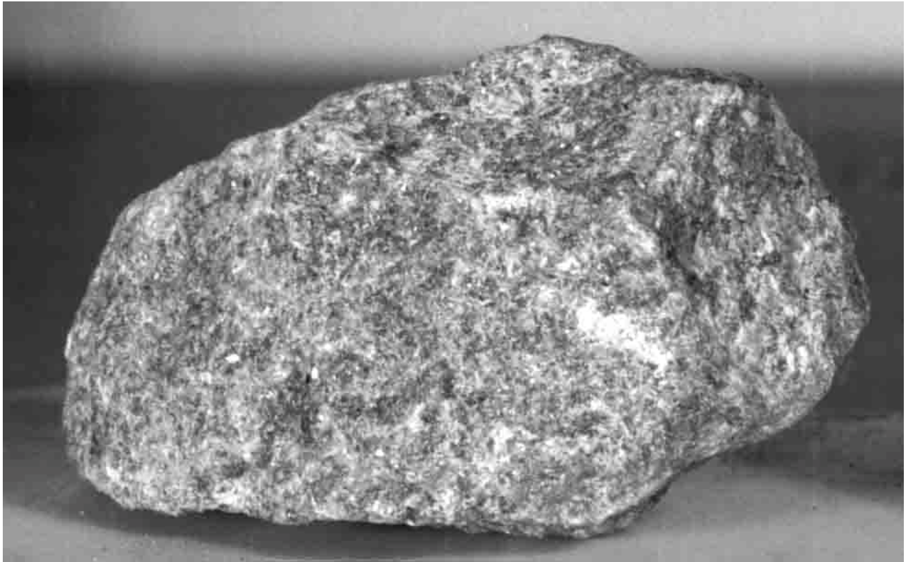
14078: width of image is approximately 3.5 cm, S-71-26046