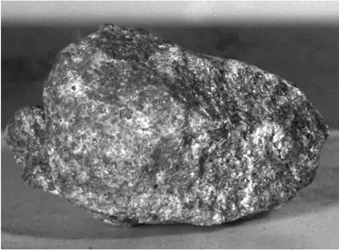
14073: width of image is approximately 3 cm, S-71-26079