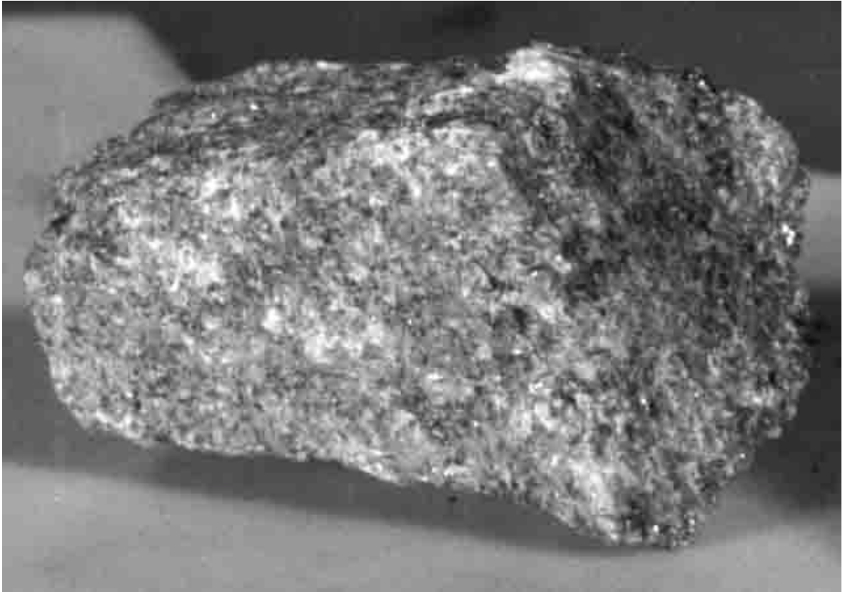
14079: width of image is approximately 1.8 cm, S-71-26050