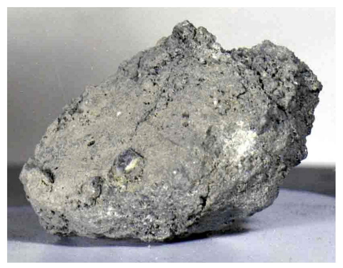
Width of image is approximately 4.5 cm, S-71-29157