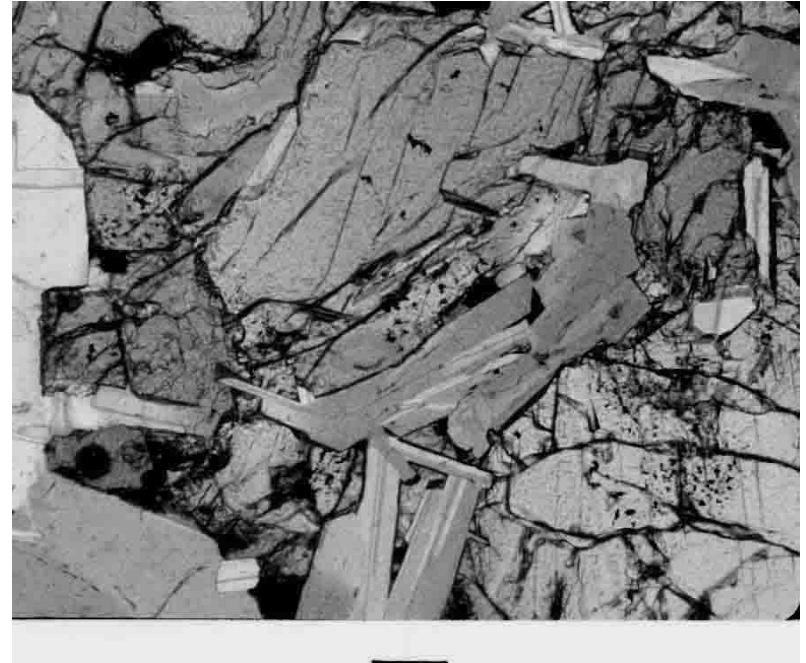
1 mm<sup>1</sup> 14053,6