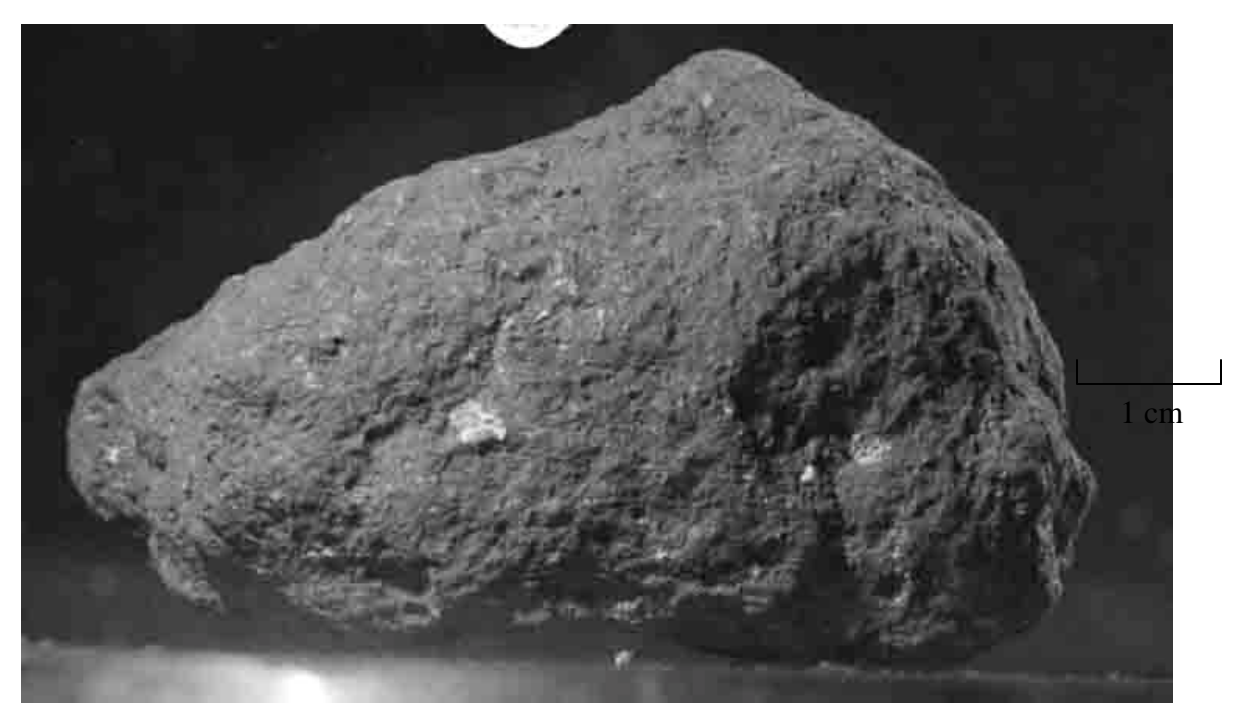
10067,0 Original PET Photo S-69-46643