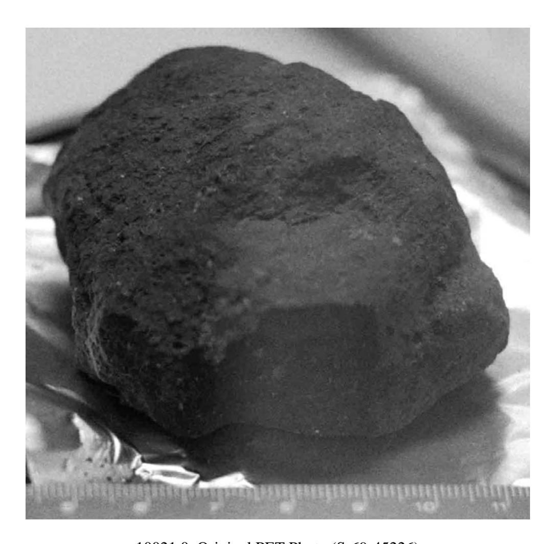
10021,0 Original PET Photo (S-69-45226)